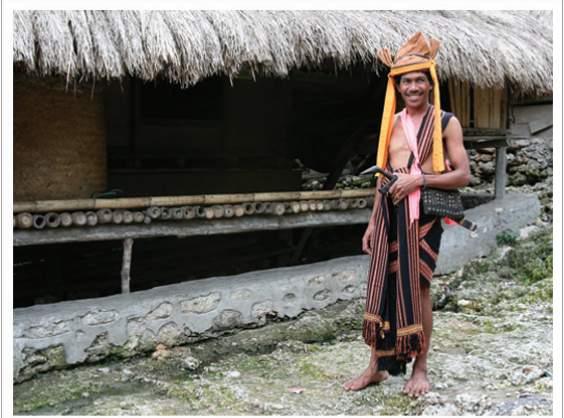
Sumba Island Villager, Indonesia

Overnight at Nihi Sumba Resort (Lamba Wave Front 1 Bedroom Villa) - Sumba