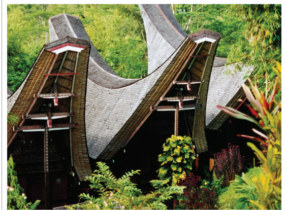
Toraja Land, Sulawesi, Indonesia