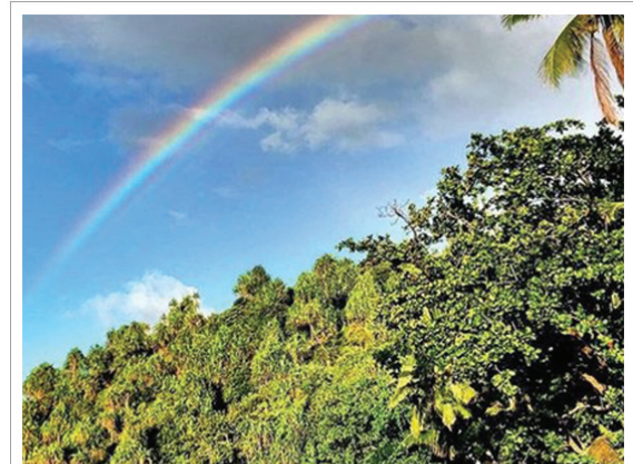
Misool Raja Ampat, Beach - Indonesia

After lunch, you will visit Londa cave, the burial site for numerous aristocrats and explore Lemo and its dozens of effigies standing solemnly, overlooking the valley below.