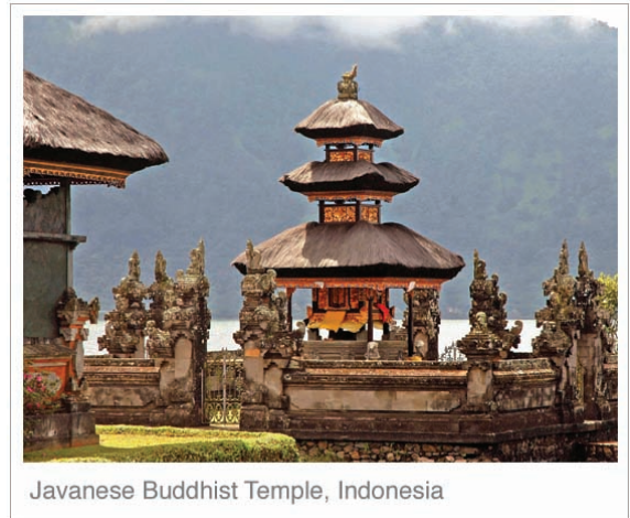
Javanese Buddhist Temple, Indonesia

Overnight at the Toraja Heritage Hotel (Deluxe Room) - Torajaland