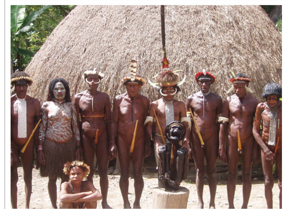
Dani Tribe, West Papua

Overnight at the Baliem Valley Resort (Superior Honai) - Wamena