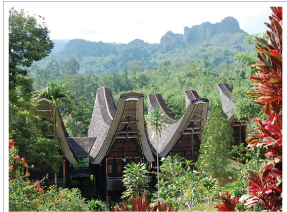
Toraja Heritage Hotel, Sulawesi, Indonesia

This hotel offers spectacular views of the sea and the city of Makassar. The panoramic view of the glorious sunset over the Sulawesi Sea can be enjoyed along the popular Losari Beach, which fronts the hotel.