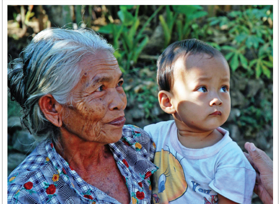
Balinese People, Indonesia

Overnight at Nihi Sumba Resort (Lamba Wave Front 1 Bedroom Villa) - Sumba