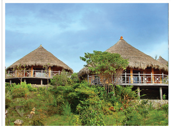
The Baliem Valley Resort, Papua

Overnight at the Baliem Valley Resort (Superior Honai) - Wamena