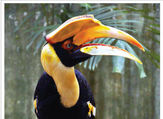
Knobbed Hornbill, Indonesia

The Baliem Valley Resort is located at 1900 meters above sea level, in the Central Highlands of Papua, part of New Guinea Island in the most east part of Indonesian Archipelago. This 3-star resort resides on 1,100 hectares near the tribal village of Desa Sekan. It features magnificent views of the forest, is surrounded by beautiful untouched nature and has access to remote Dani villages.