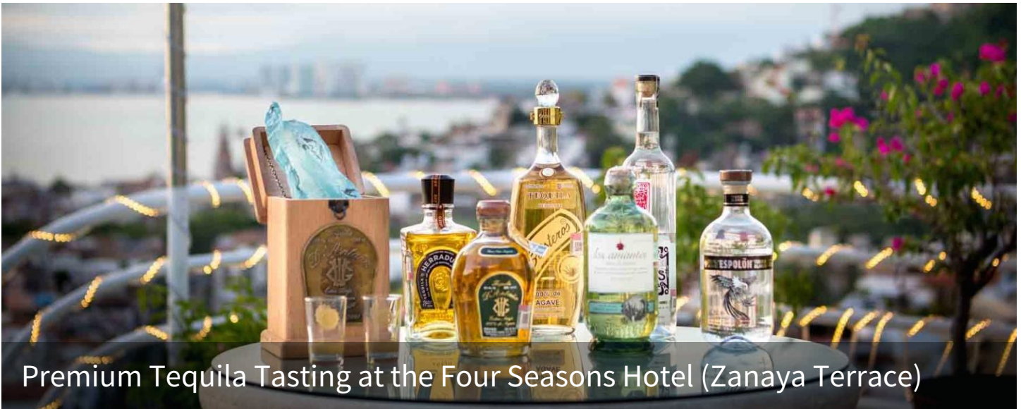
Premium Tequila Tasting at the Four Seasons Hotel (Zanaya Terrace)