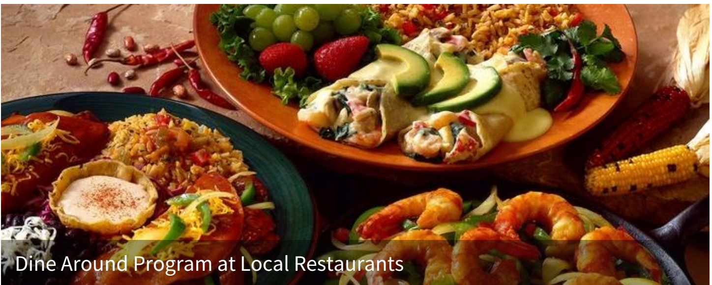
Dine Around Program at Local Restaurants