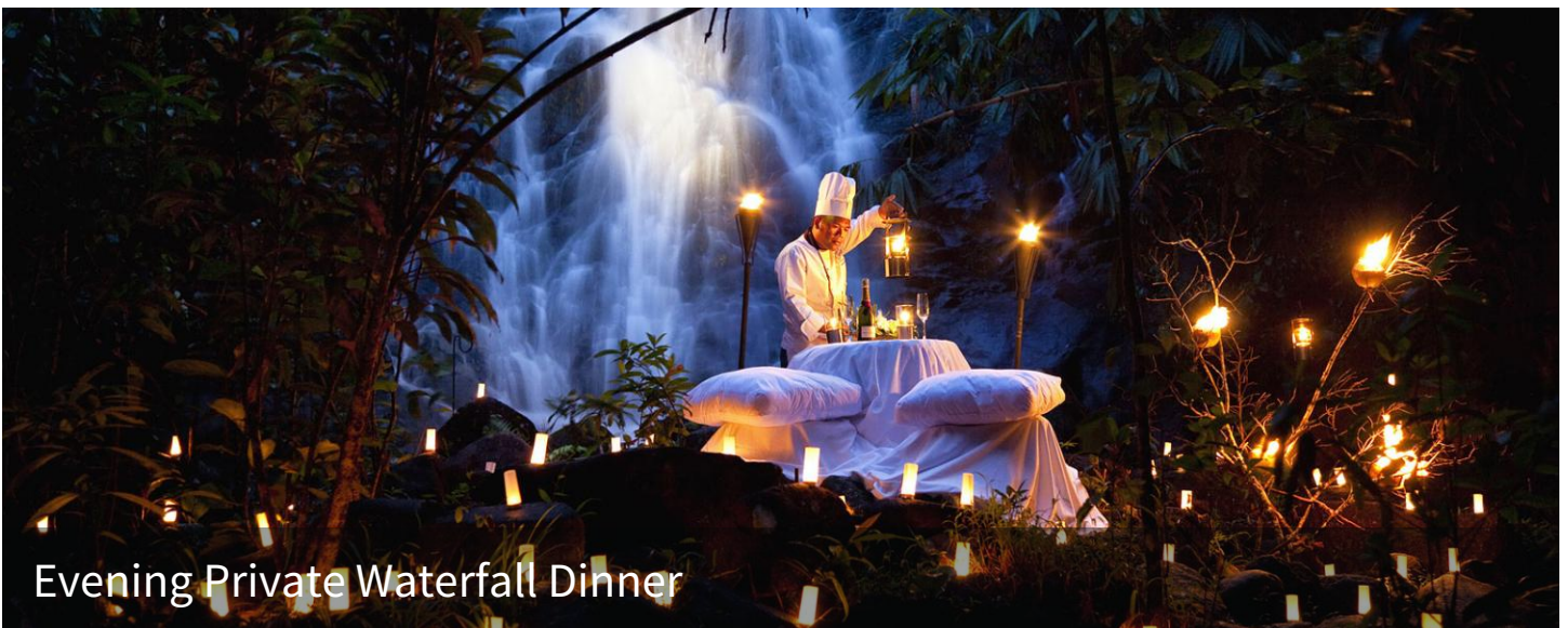
Evening Private Waterfall Dinner

This evening you will head to a private waterfall to experience a once in a lifetime dining event. Here you will dine under candlelight next to a waterfall. Your private chef has curated a stunning menu to match the beauty of your surroundings.