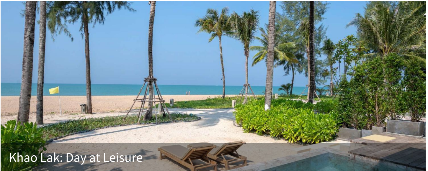
Khao Lak: Day at Leisure