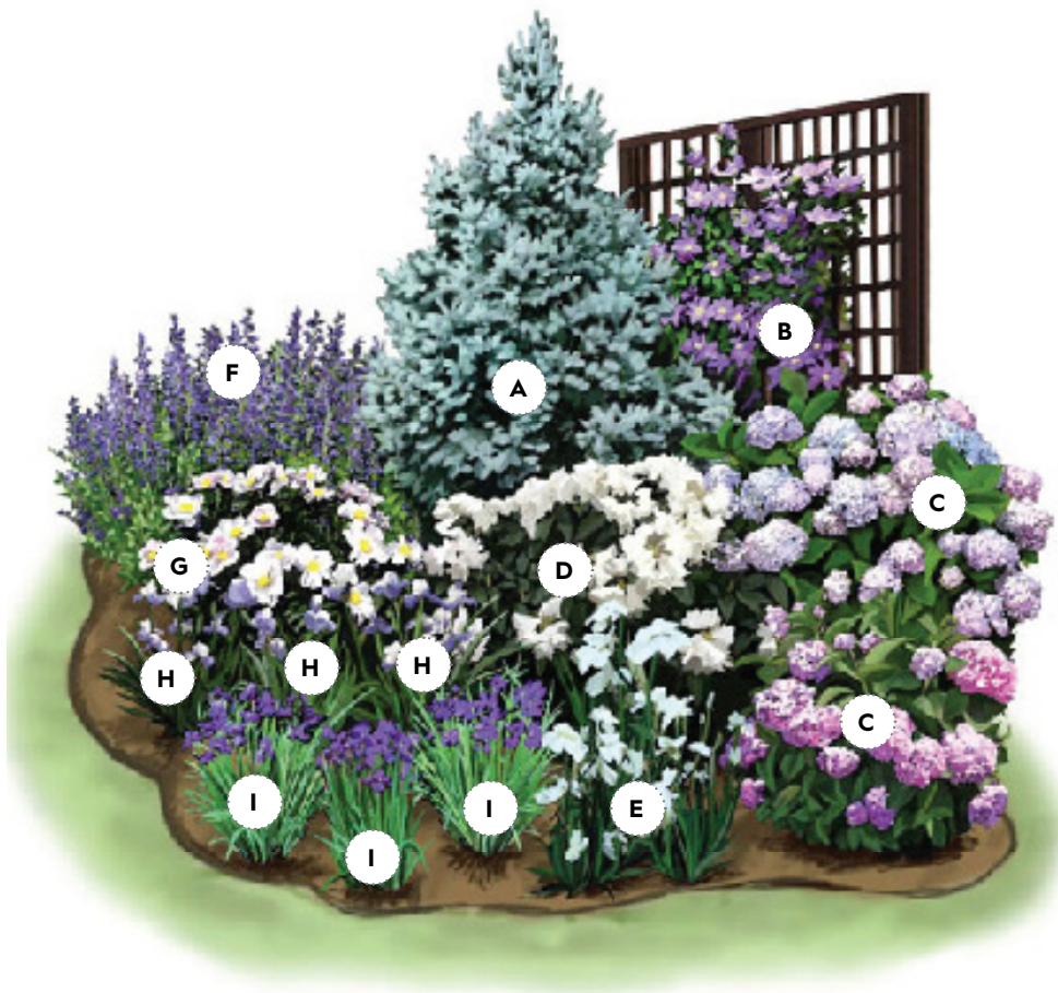
LAYOUT DIAGRAM (each square = 1 foot)

Create a pocket of color in your yard with this garden plan filled with easy-to-grow favorites.