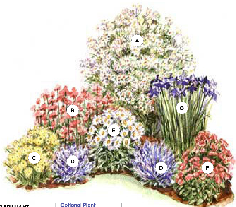
LAYOUT DIAGRAM (each square = 1 foot)

5 FORTISSIMO DAFFODIL ( Narcissus 'Fortissimo'): Zones 3-7