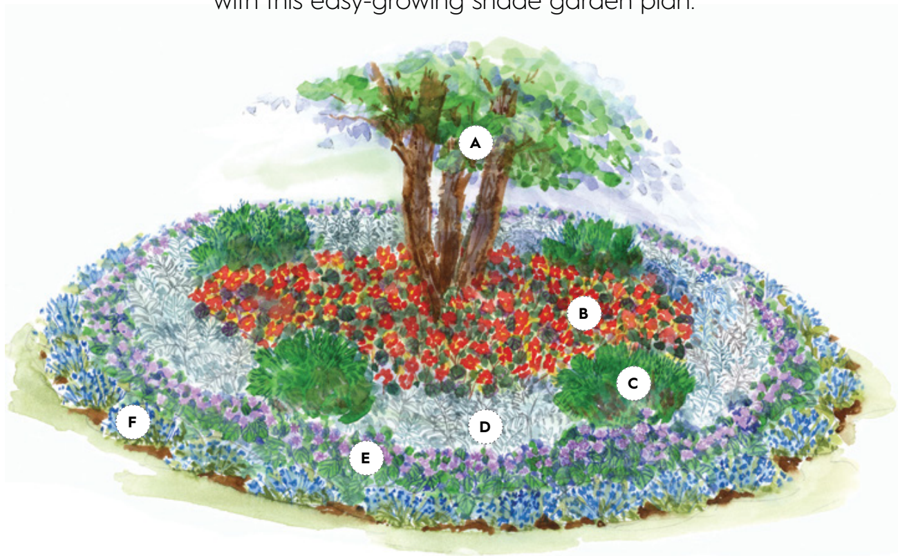
LAYOUT DIAGRAM (each square = 1 foot)

Enjoy beautiful color all spring and summer with this easy-growing shade garden plan.