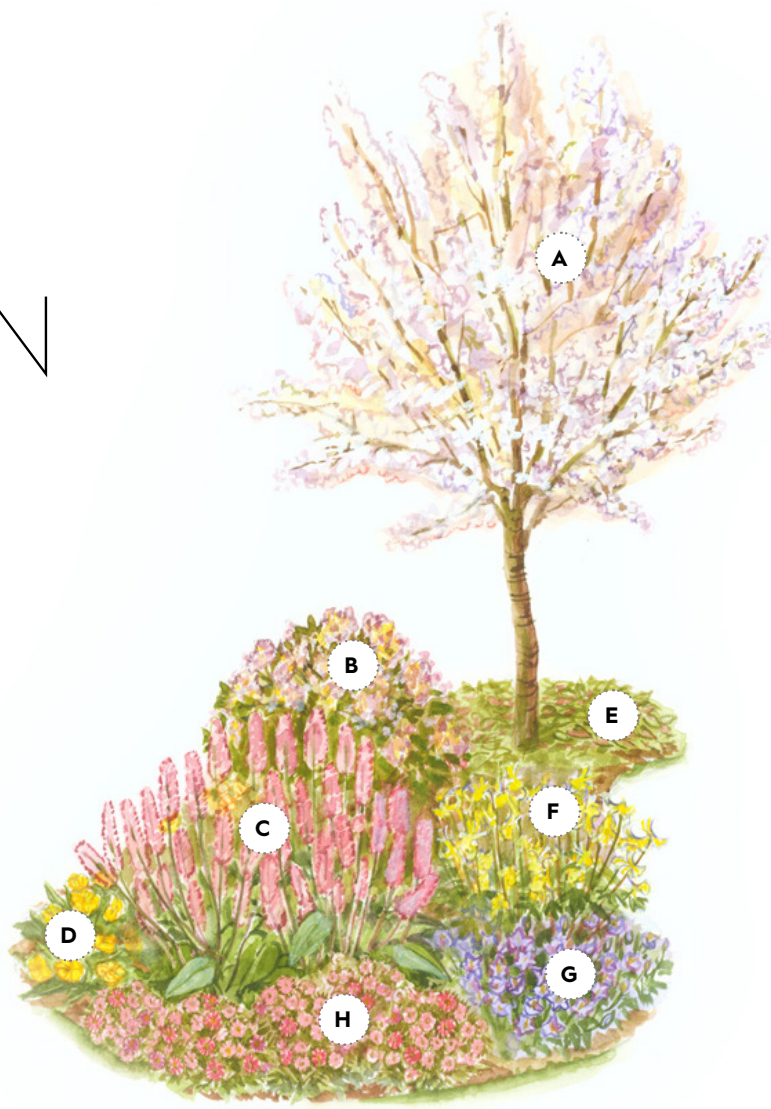
LAYOUT DIAGRAM (each square = 1 foot)

▲ 5 JACK SNIPE DAFFODIL ( Narcissus 'Jack Snipe') Zones 3-8