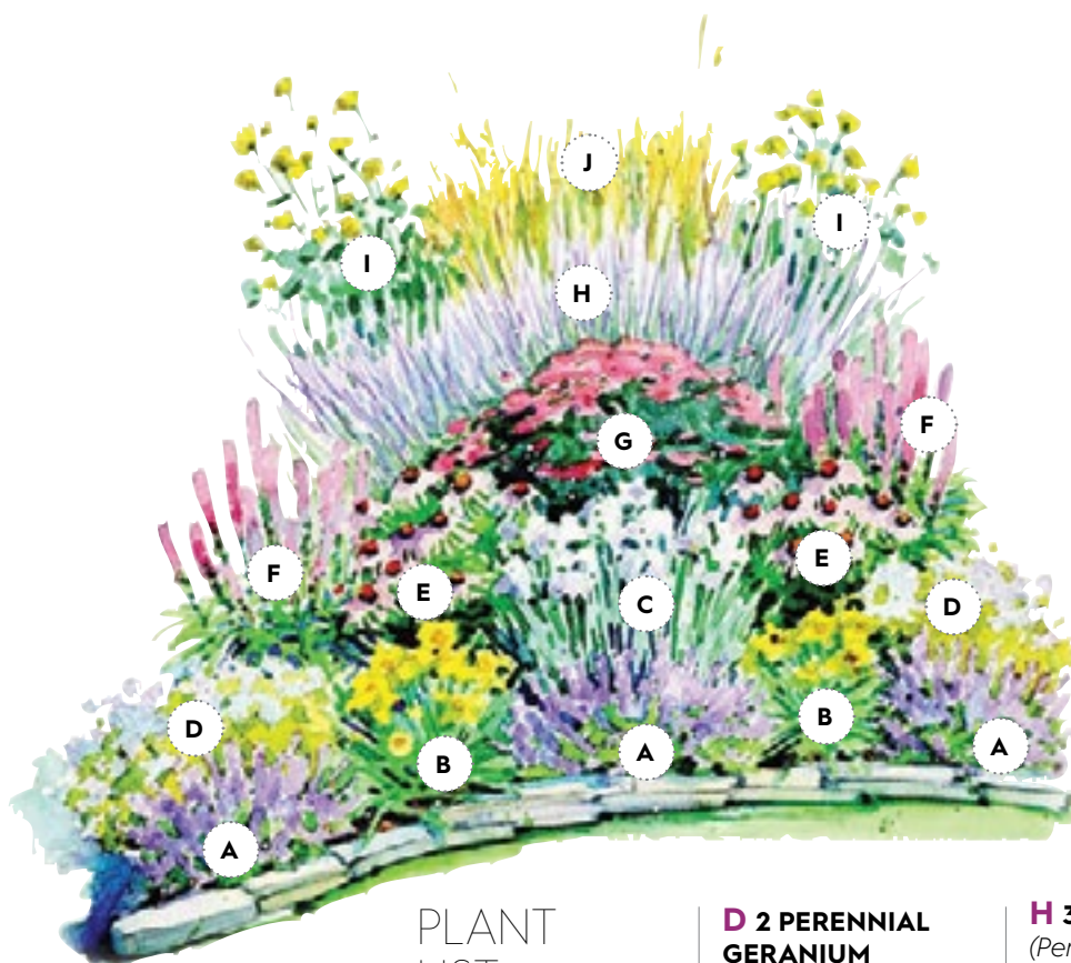
LAYOUT DIAGRAM (each square = 1 foot)

Add this low-maintenance collection of perennial flowers to your yard for dazzling seasonal color.