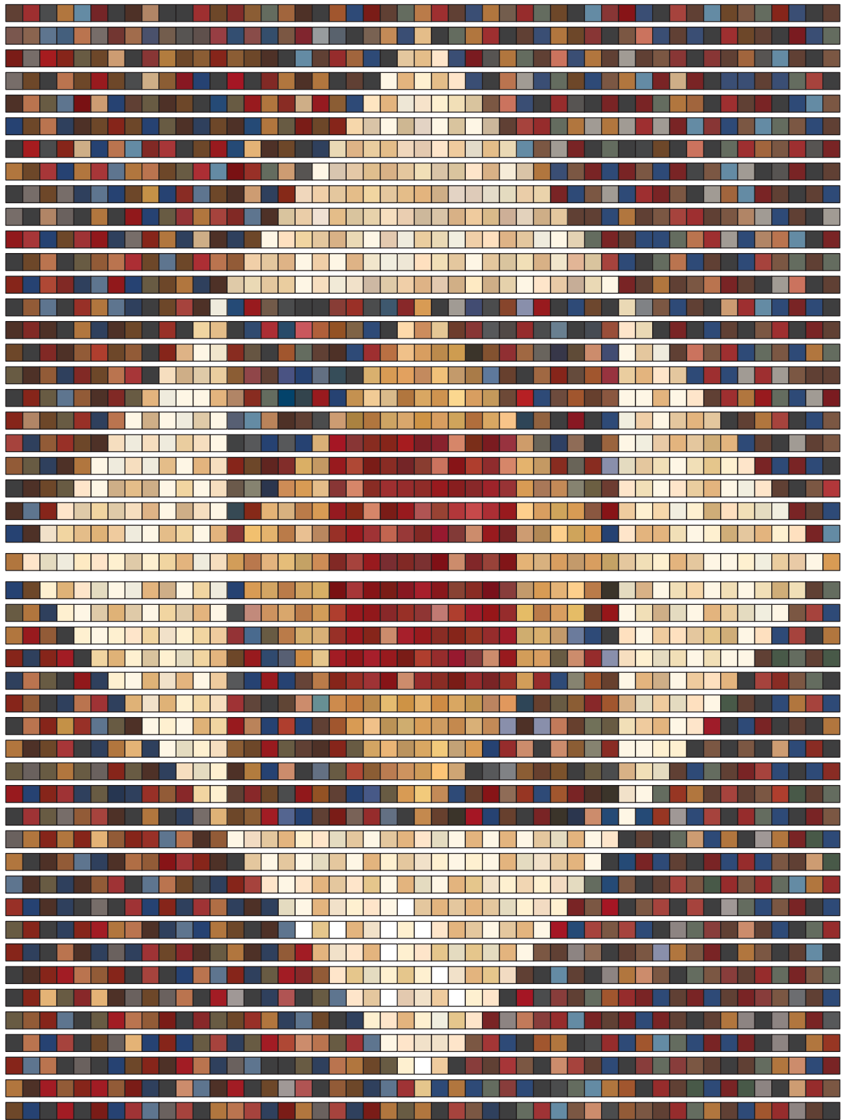
QUILT ASSEMBLY DIAGRAM