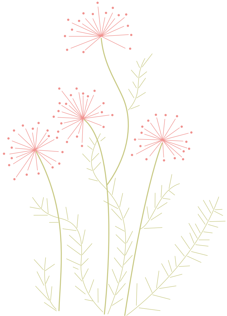
NATURAL WONDERS: DANDELIONS FULL-SIZE EMBROIDERY PATTERN