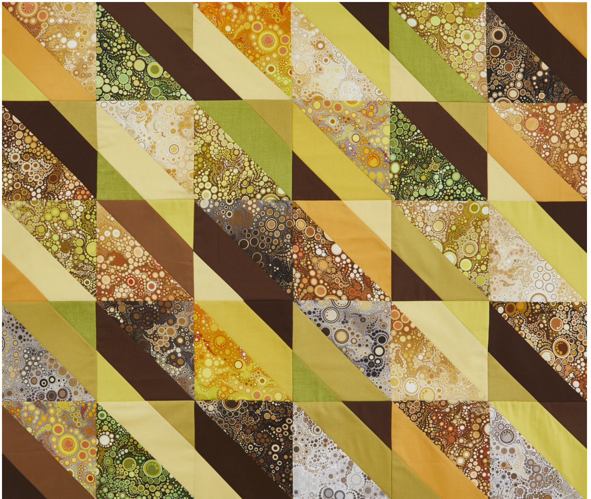
FABRICS are from the Effervescence collection by Robert Kaufman Fabrics (robertkaufman.com).