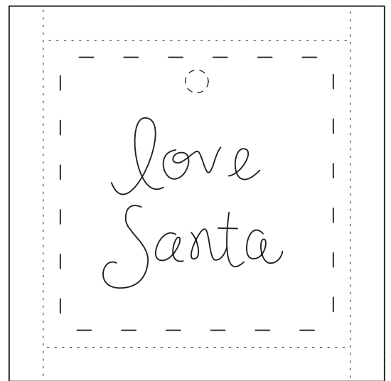
Tag Along "Love Santa" Tag Pattern