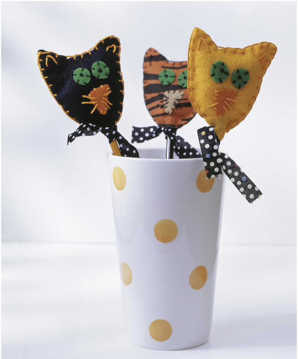
These felted pencil toppers make the perfect gift for young children and cat lovers!