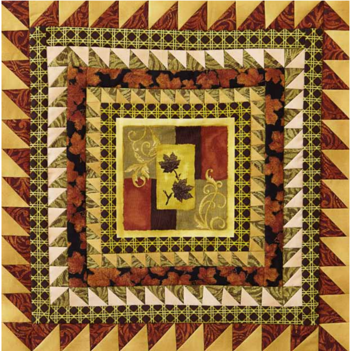
FABRICS are from the Northern Exposure collection by Benartex (benartex.com).