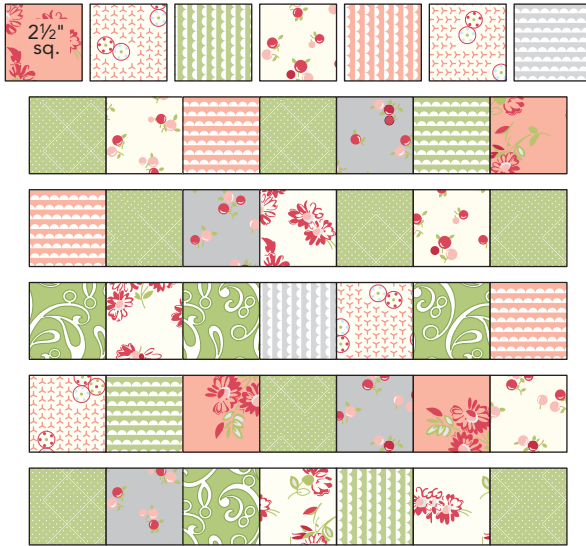
PLACE MAT TOP ASSEMBLY DIAGRAM