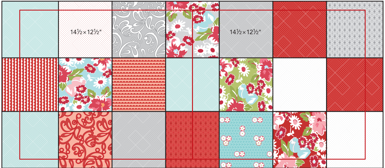
PLACE MAT BACK CUTTING DIAGRAM