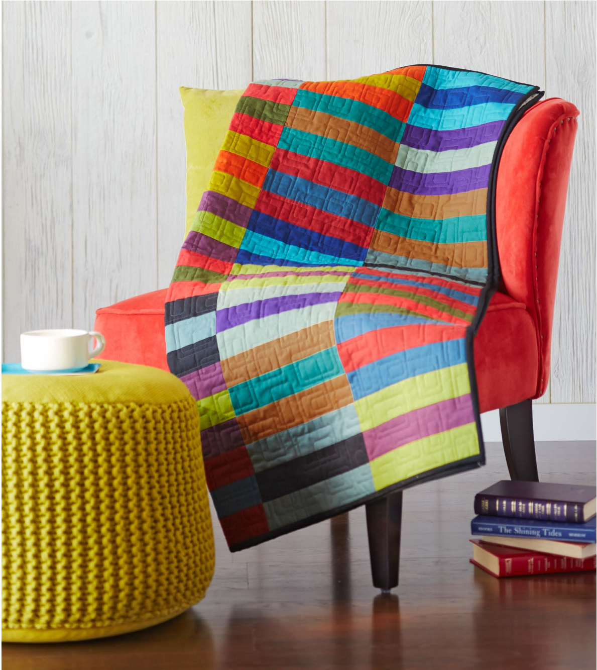
FABRICS are from the Linen Mochi Solids collection by MoMo for Moda Fabrics (modafabrics.com).