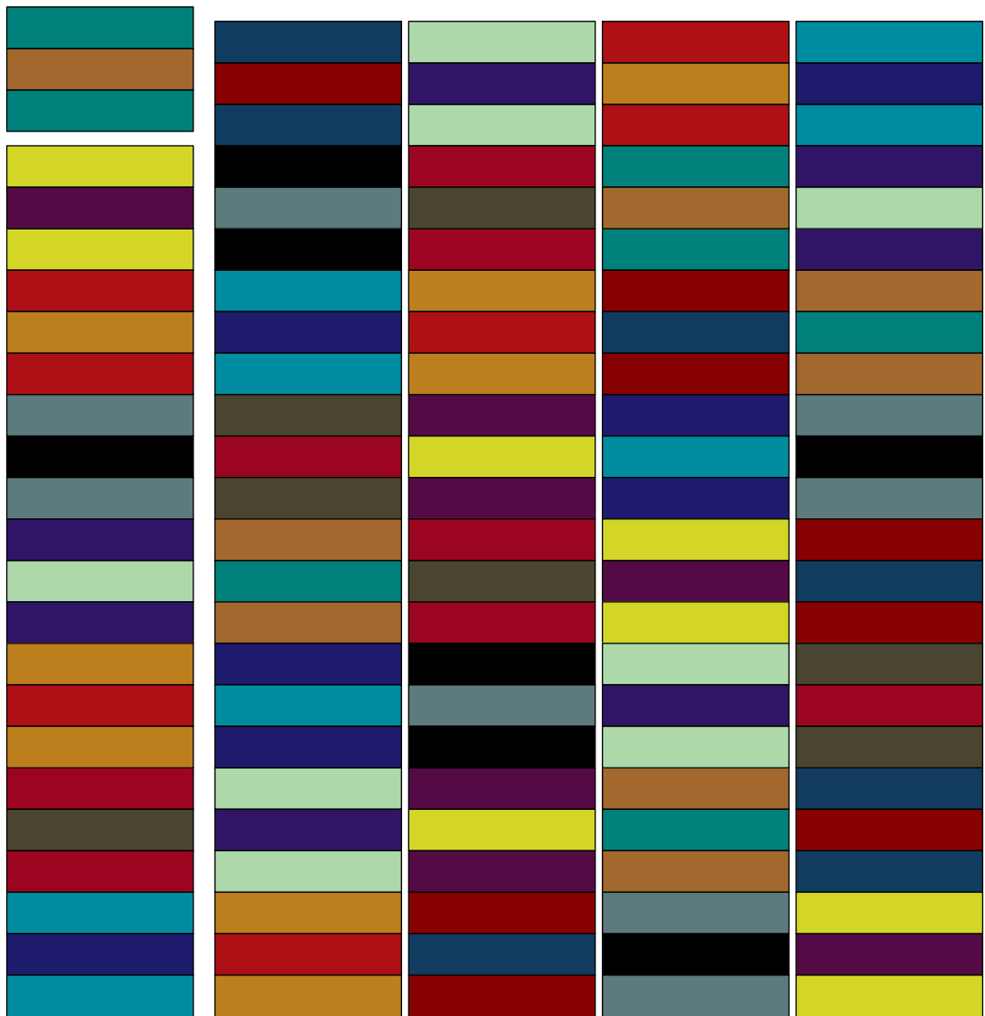
QUILT ASSEMBLY DIAGRAM