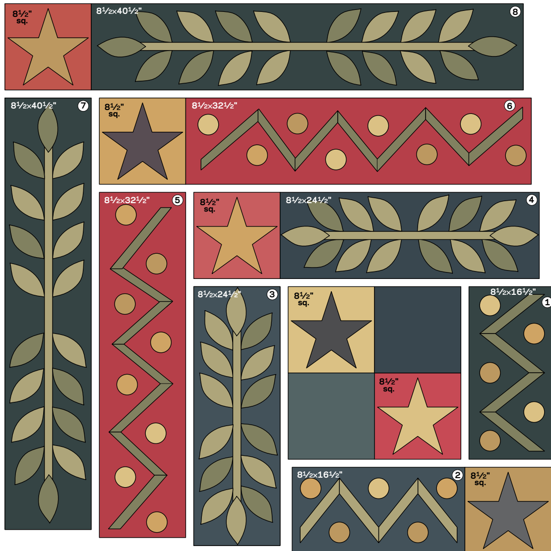
QUILT ASSEMBLY DIAGRAM