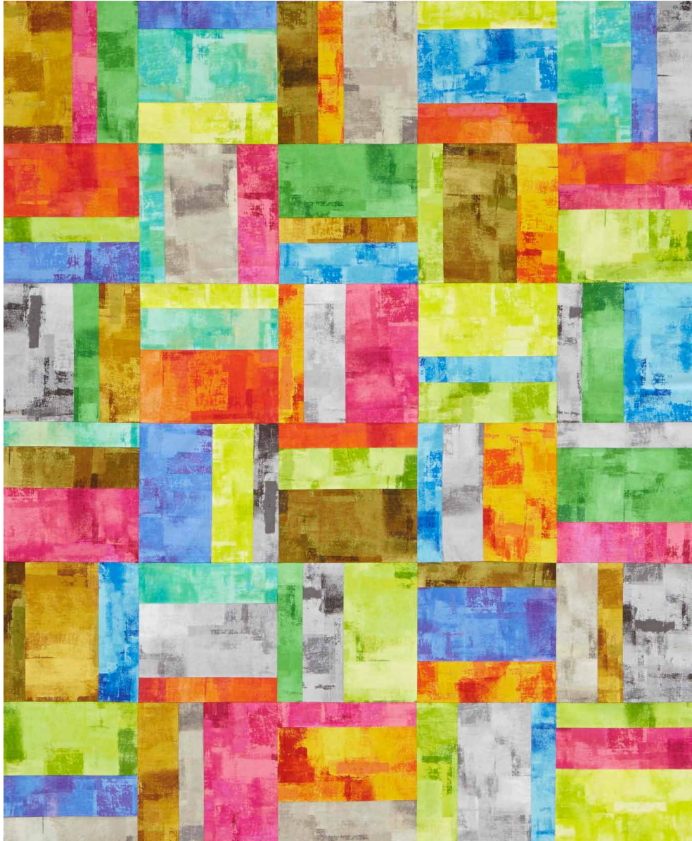
FABRICS are from the Textura collection by Susy Pilgrim Waters for P&B Textiles ( pbtex.com ).

INSPIRED BY PETITE CHIC FROM DESIGNER EMILY HERRICK OF CRAZY OLD LADIES ( CRAZYOLDLADIESQUILTS.BLOGSPOT.COM ) QUILT TESTER: JAN RAGALLER