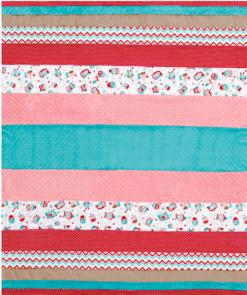
FABRICS are from the Nested Owls collection by Adornit and the Kozy Cuddle collection, both from Shannon Fabrics ( shannonfabrics.com ).