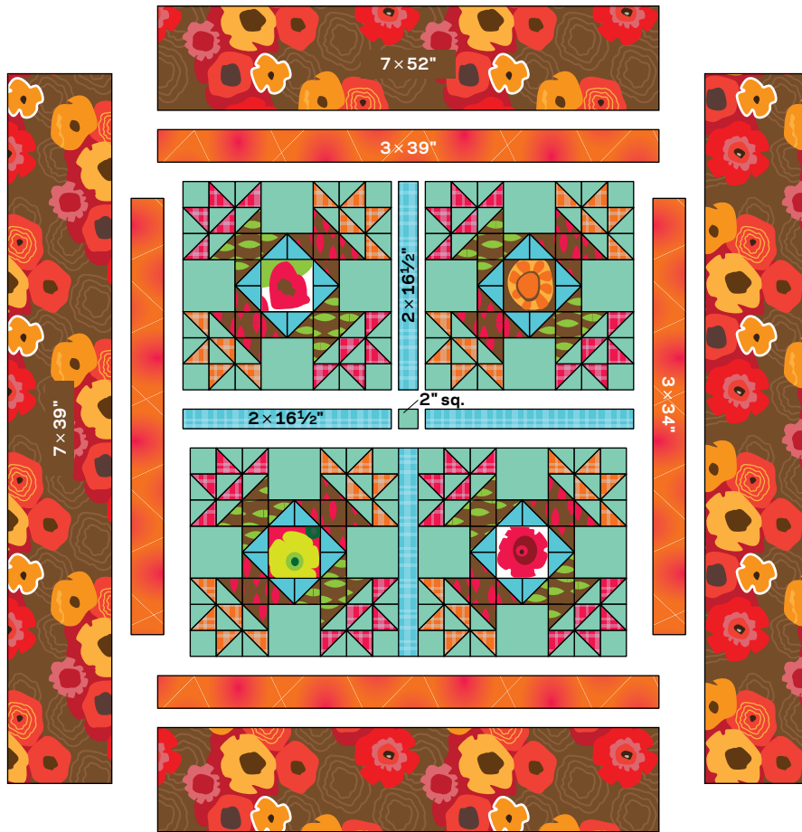
QUILT ASSEMBLY DIAGRAM