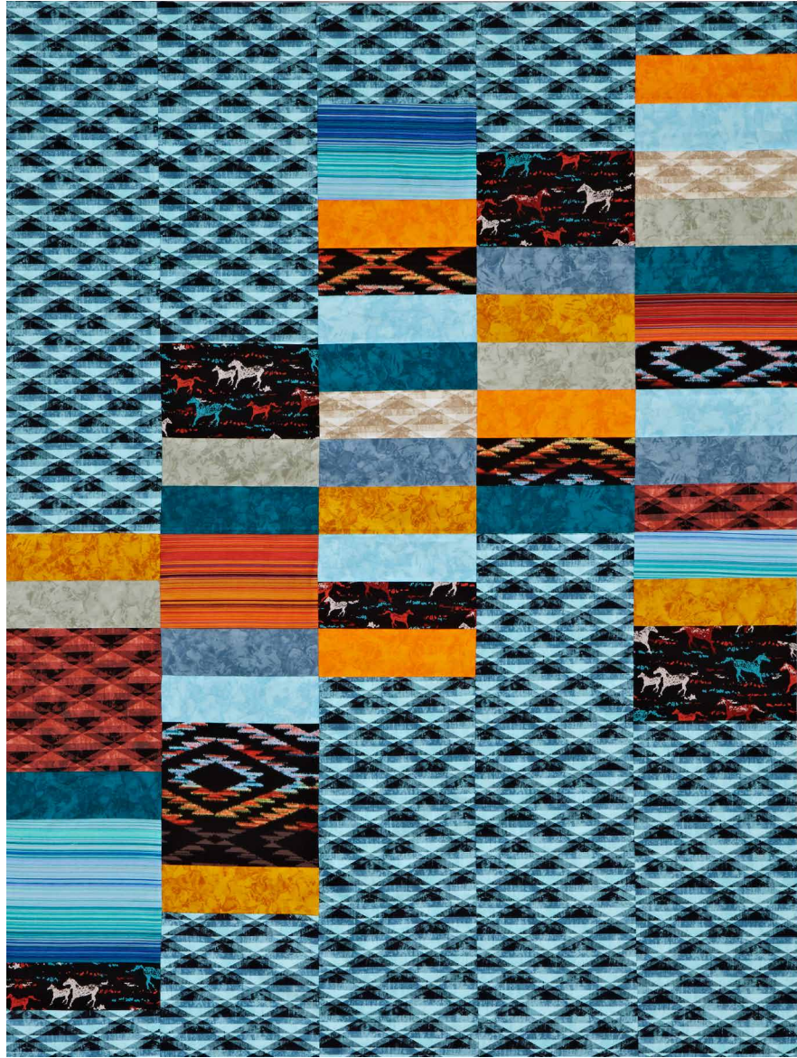
FABRICS are from the Wild Horses and Krystal collections by Michael Miller Fabrics (michaelmillerfabrics.com).