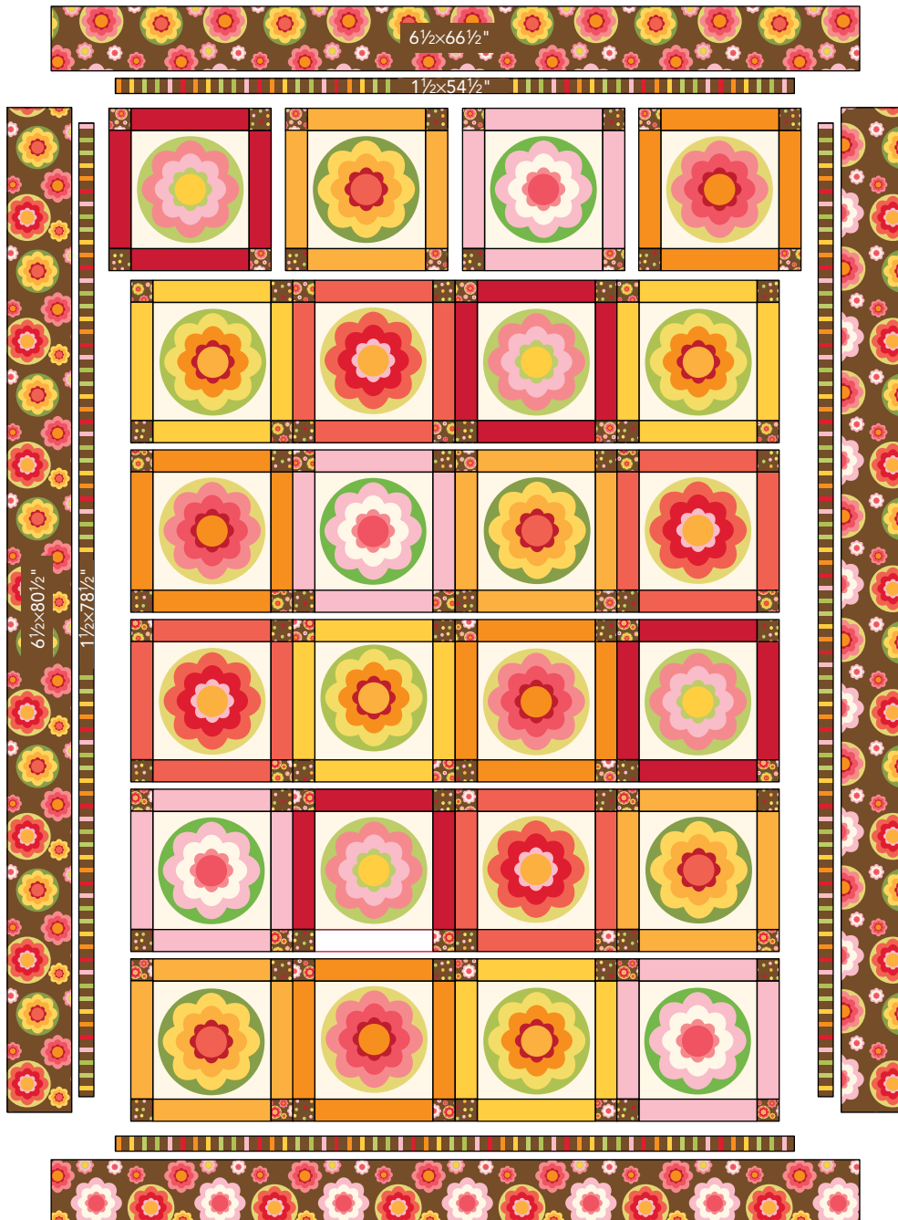
QUILT ASSEMBLY DIAGRAM