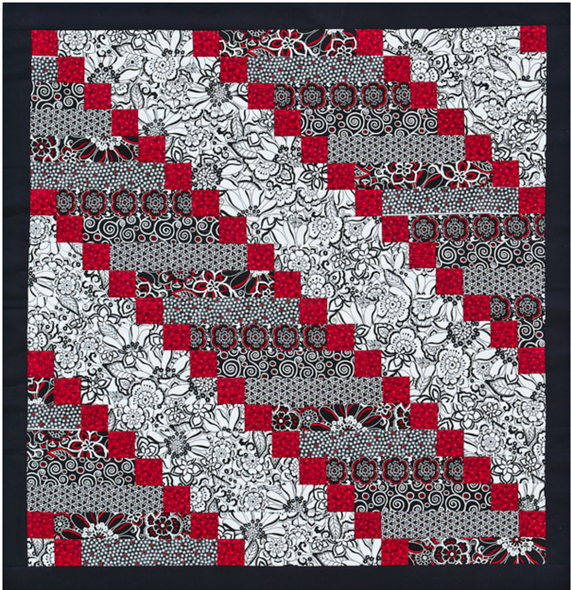
FABRICS are from the Tanglewood, Florina, and White Out collections from Blank Quilting ( blankquilting.com ).