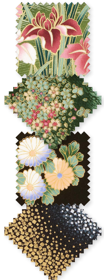
Fuse a Zen garden-like table runner using Asian prints from the Hanako's Treasures collection by Hoffman California Fabrics ( hoffmanfabrics.com ).