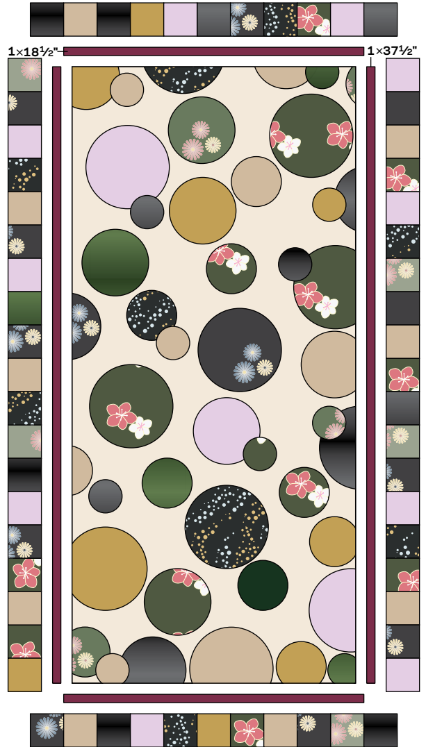
QUILT ASSEMBLY DIAGRAM