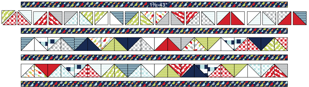
TABLE RUNNER ASSEMBLY DIAGRAM