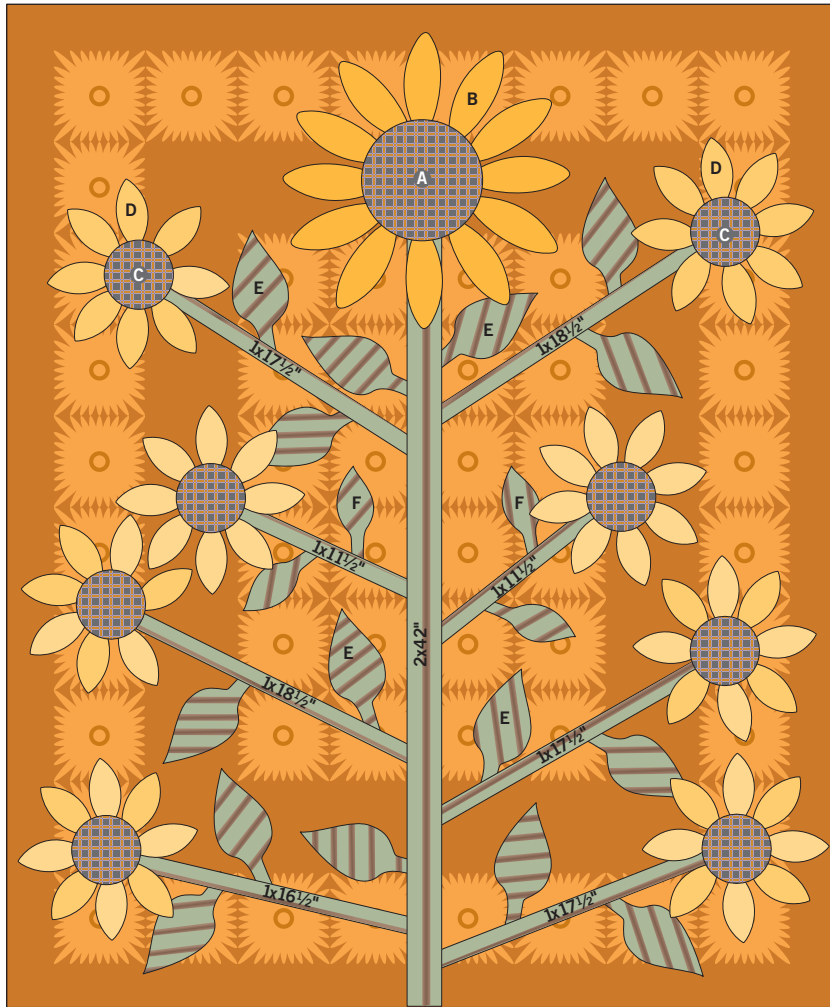
APPLIQUÉ PLACEMENT DIAGRAM