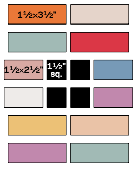
BLOCK ASSEMBLY DIAGRAM