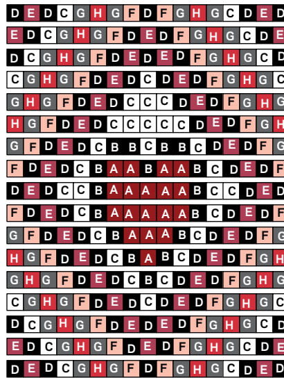
QUILT CENTER ASSEMBLY DIAGRAM