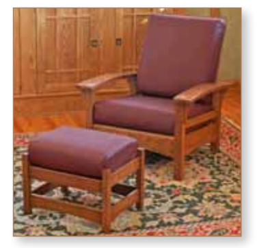
Visit the WOOD Store at: WOODStore.net